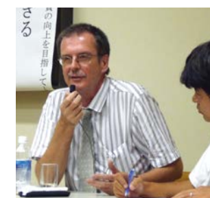
Special lecture by a professor from Norway