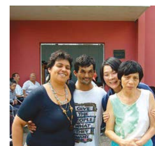
International Practicum in Brazil

If you would like to know more about SCU's international activities, including student overseas programs, training programs for international students/healthcare professionals, and partnerships/collaborations with foreign institutions, please contact IEC.