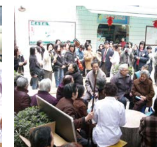
Site visit for public health activities in China