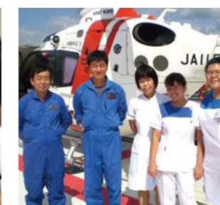
Students from Singapore on Overseas Clinical Attachment at one of Seirei's hospitals